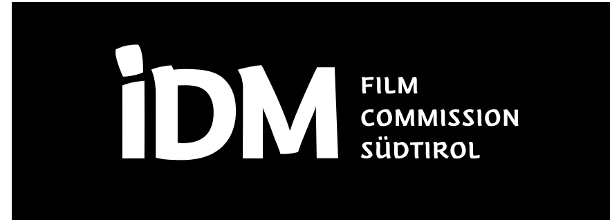
Monochrome inverted (white)