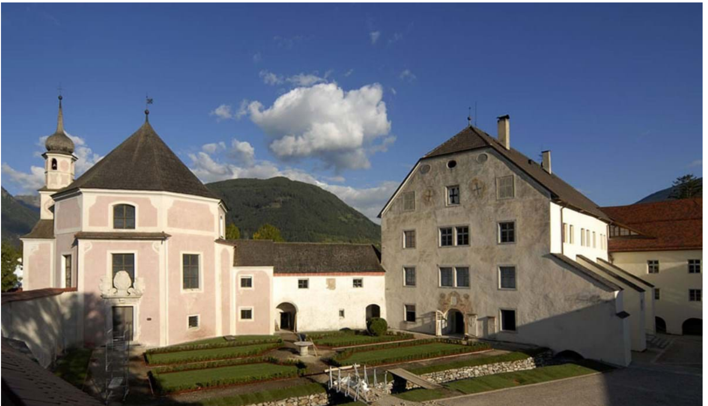
Harald Kienzl, © photo: Harald Kienzl - KUADRAT OHG