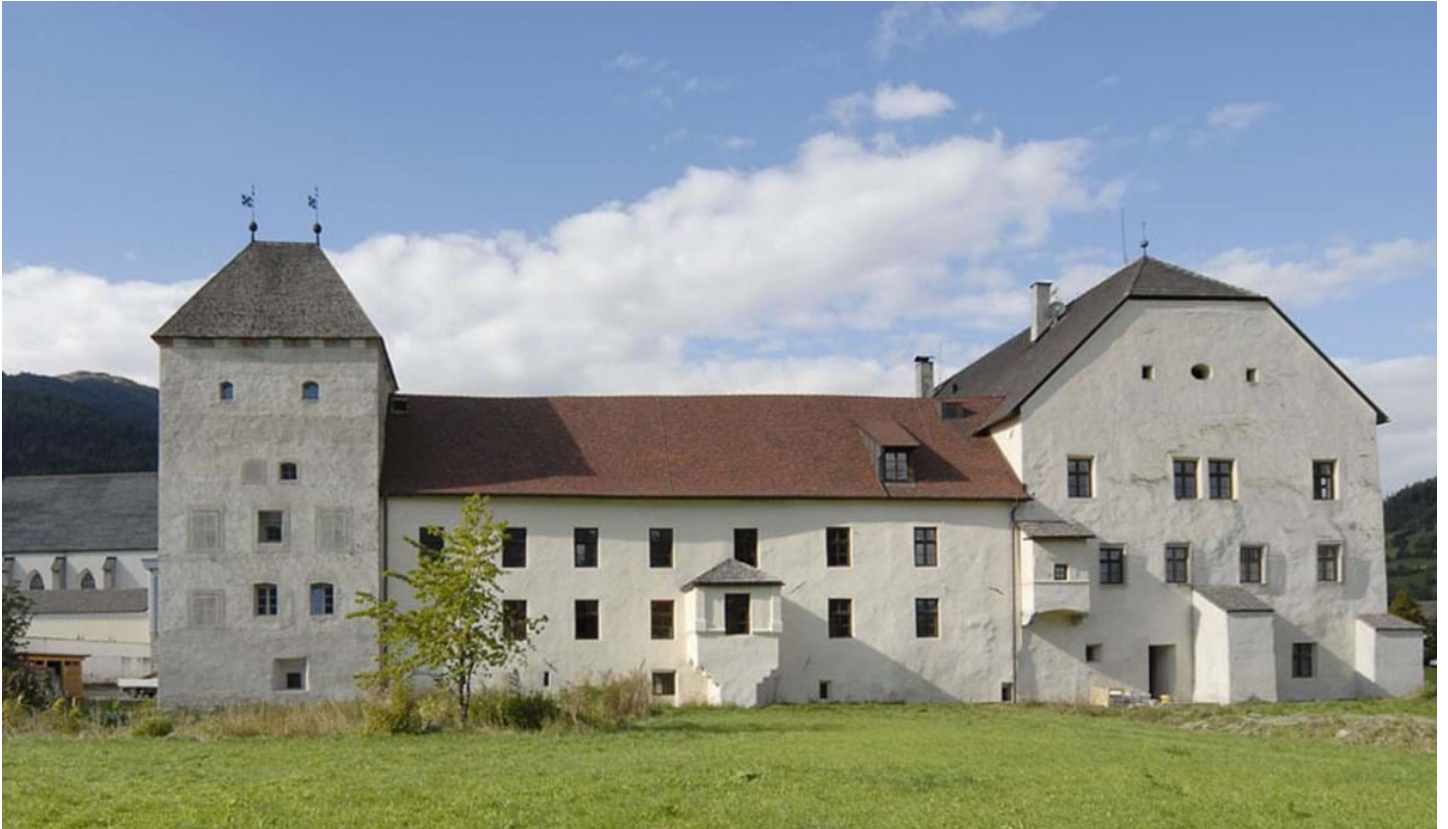
Harald Kienzl, © photo: Harald Kienzl - KUADRAT OHG