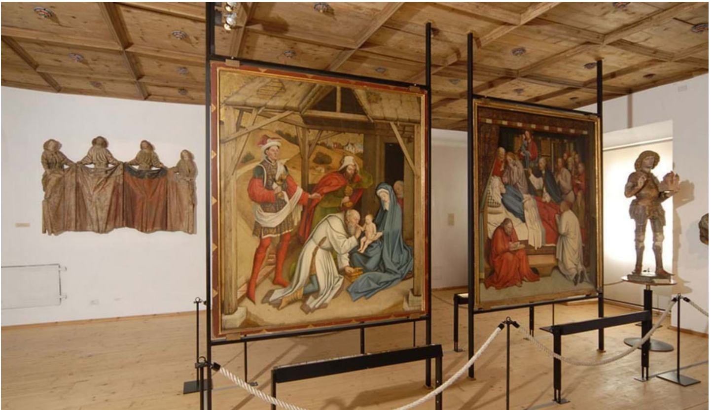
Harald Kienzl, © photo: Harald Kienzl - KUADRAT OHG