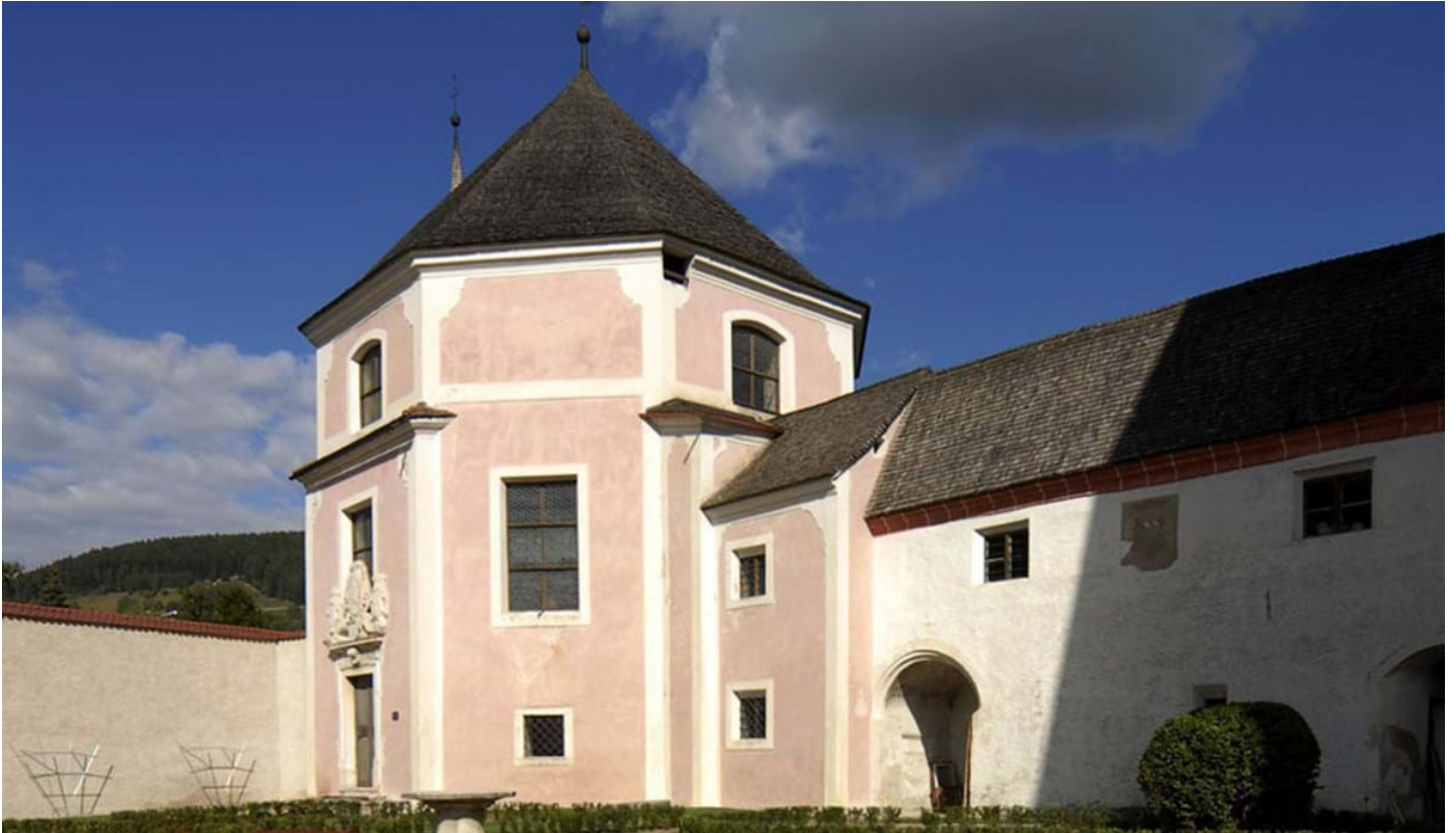
Harald Kienzl, © photo: Harald Kienzl - KUADRAT OHG