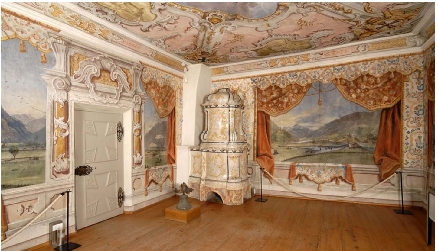
Harald Kienzl