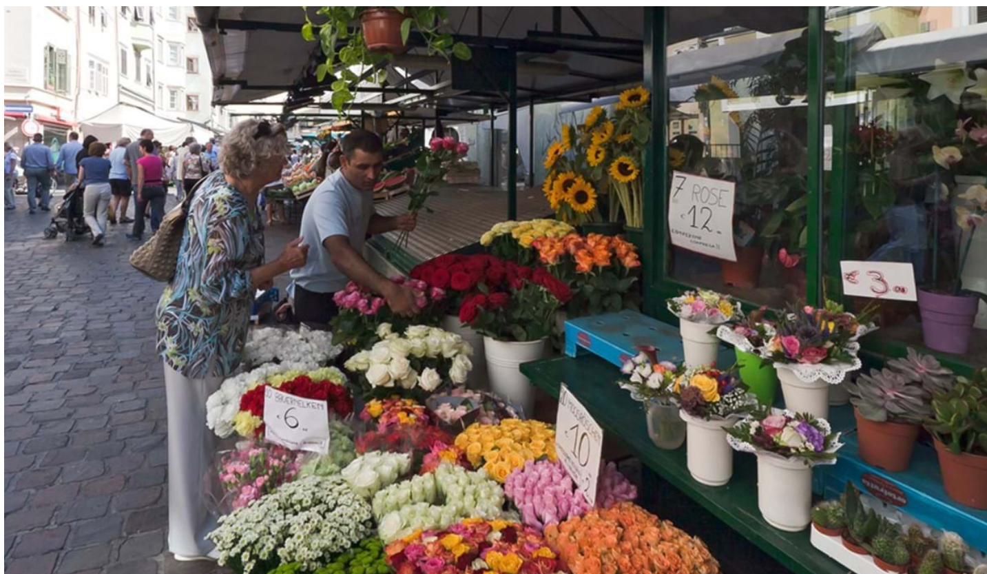
Florian Mohn